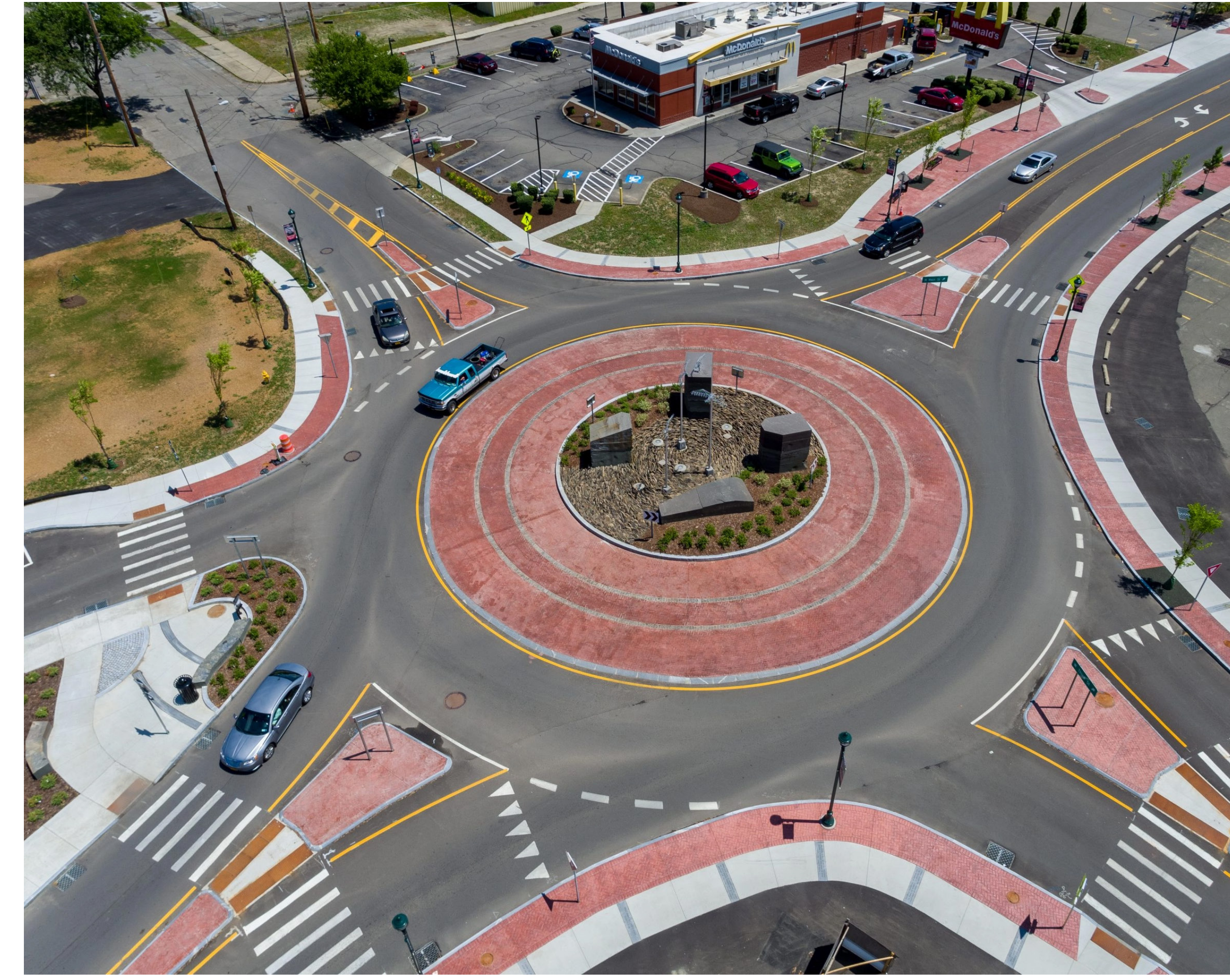
Elmira North Main Street Cultural Connector