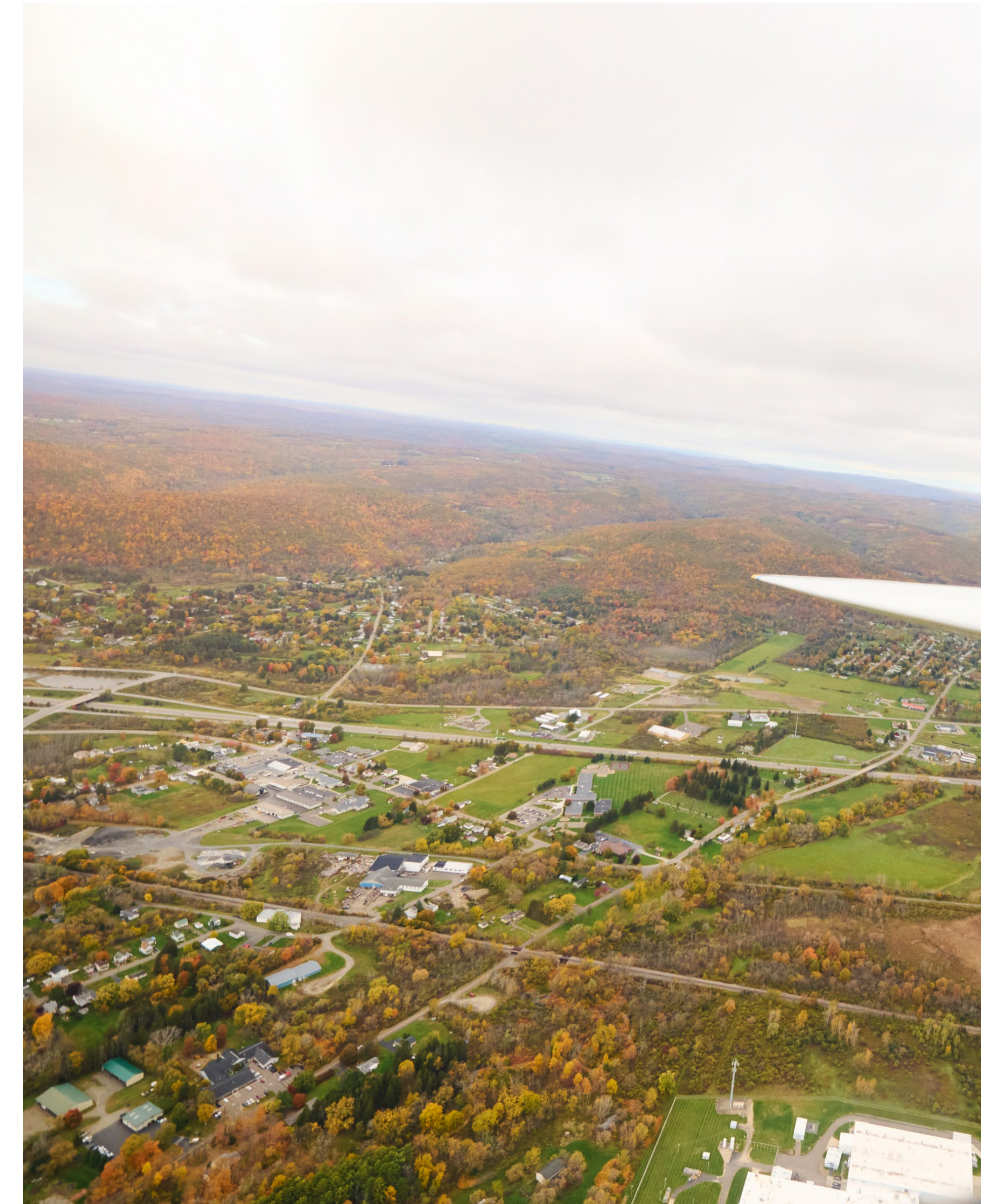
Chemung County Landscape