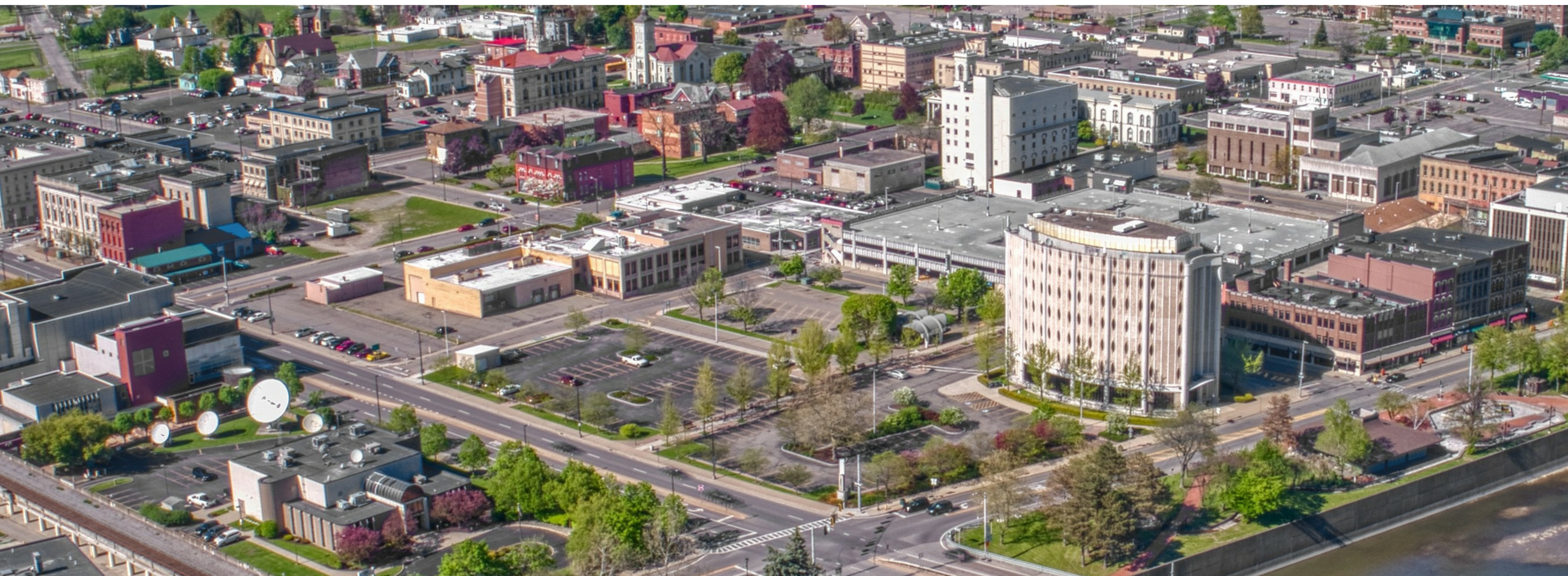
Federal Priorities Identified in the "2040 Long Range Transportation Plan" adopted in 2019.