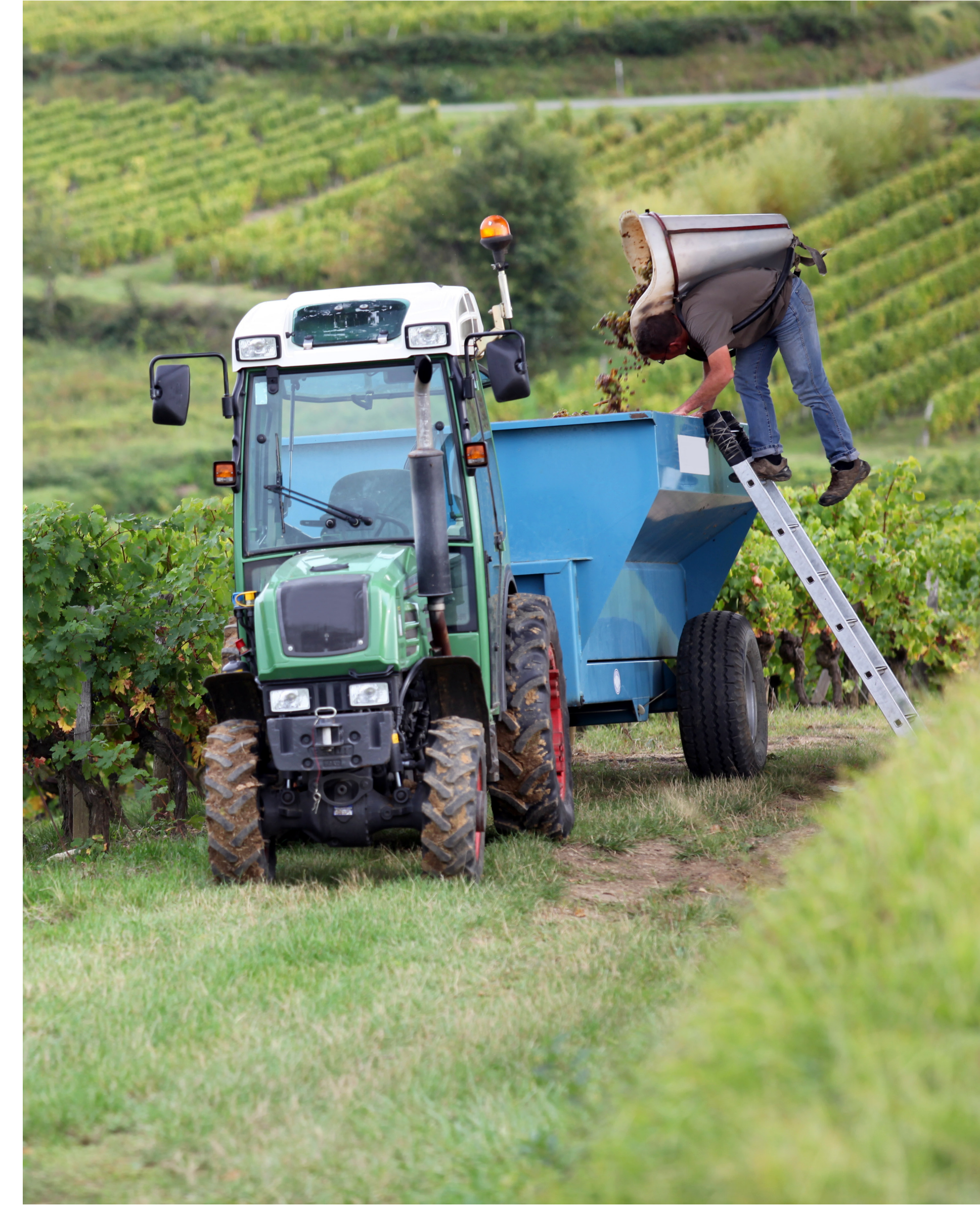
Tractor In Vineyard Grape Trees