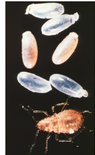
From “flat as a piece of paper” to “animated blood drop”—a common bed bug shown before feeding (top left) and afterwards (bottom left). At right, a newly hatched bed bug shown next to empty and maturing eggs.